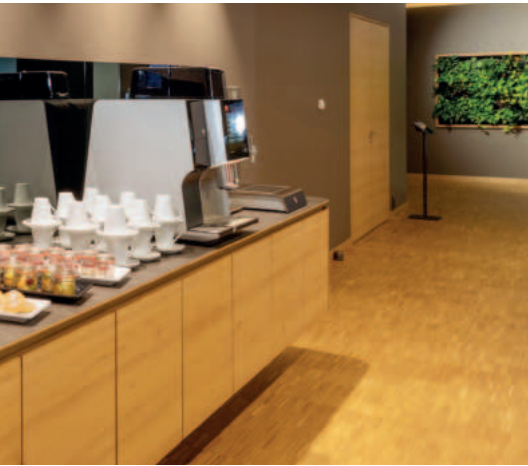
Writable touch displays (» room 1 & 4)