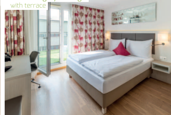
Room category "Prestige" with terrace