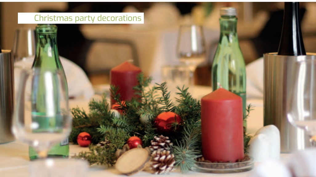
Christmas party decorations

We realize your wishes and ideas for your event! Please send us an inquiry at mezzanin@zeitgeist-vienna.com .